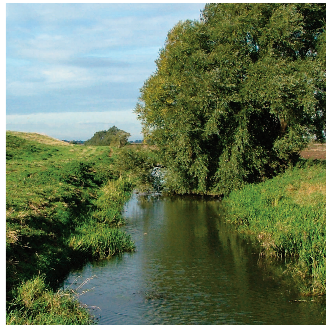
A circular walk of 12 or 9 km (7½ or 5½ miles)