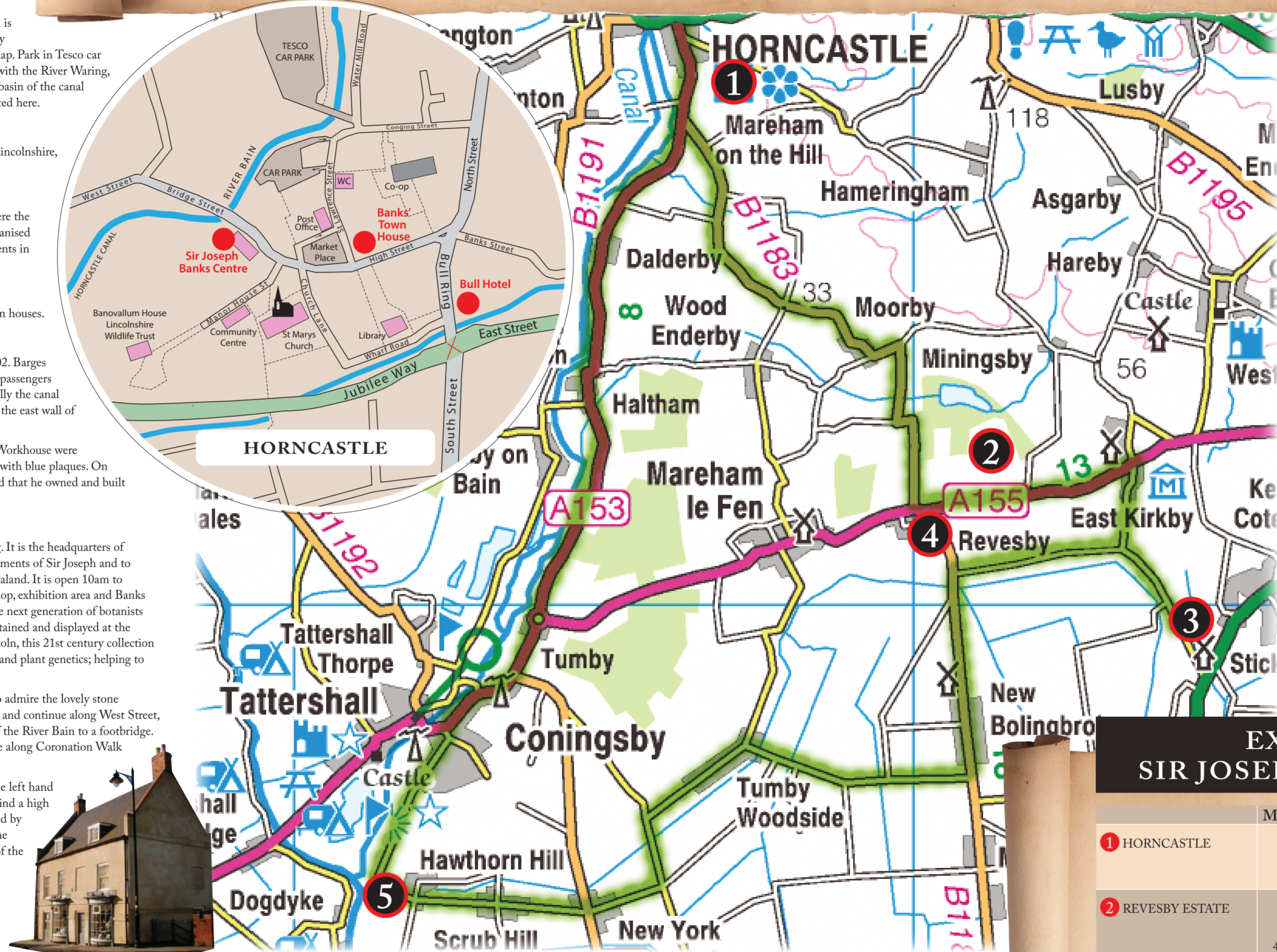
The Joseph Banks Centre, Bridge Street