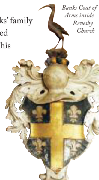
Banks Coat of Arms inside Revesby Church

The estate had been in the Banks' family since 1714 when it was purchased by Joseph's great-grandfather. This ambitious man was agent for the Dukes of Norfolk, Leeds and Newcastle. As his financial position improved he invested his wealth in land, and Joseph's grandfather and father continued to build on increasing the family's financial security.