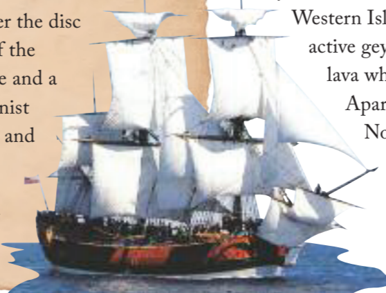
Replica of the HM Bark Endeavour