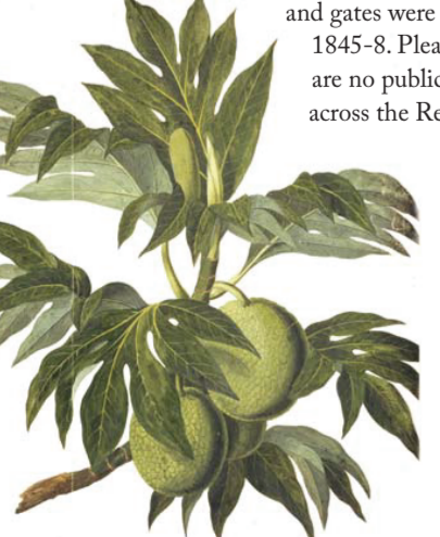
Parkinson's drawing of Breadfruit © The Natural History Museum, London

From the A155 layby, east of Revesby, where there is an information board, you can see the parkland which has changed relatively little over the past 250 years. Banks lived here as a child and visited every autumn after his marriage. The former mansion, built in 1663, stood in parkland sited half way between the present house and the A155. The present mansion, screen and gates were erected in 1845-8. Please note there are no public rights of way across the Revesby Estate.