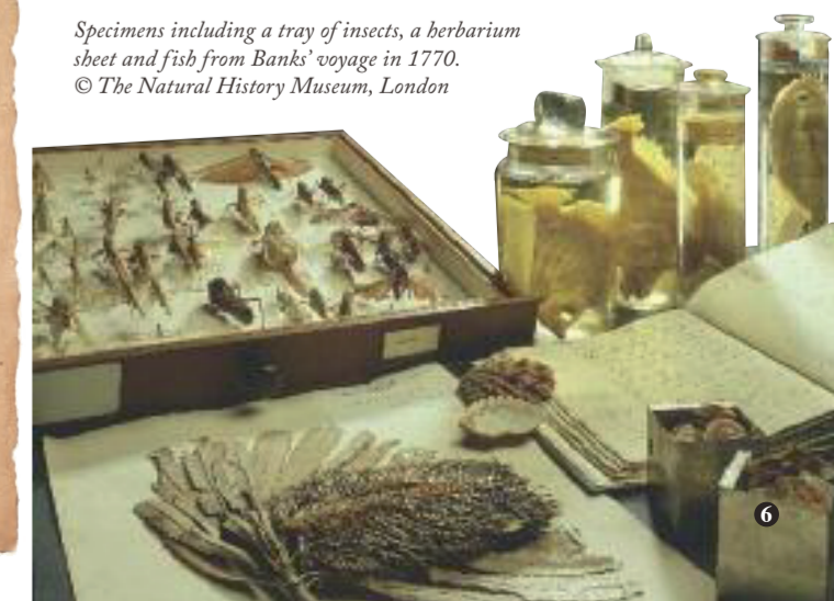
Specimens including a tray of insects, a herbarium sheet and fish from Banks' voyage in 1770.

Banks undertook the cataloguing of this collection. By 1784 the mammoth task was complete with 800 plates prepared of Sydney Parkinson's botanical drawings, but sadly, spiralling costs prevented publication. The collection was left to the British Museum, later transferred to the Natural History Museum London as the Banks Archive.