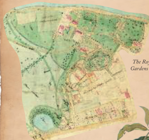
Plan of The Royal Botanic Gardens Kew 1837

Shortly after returning from Australia, Banks was received by King George III and they formed a long-standing friendship. In 1780 Banks became involved with developments at Kew Gardens. With the King as Patron and Banks as unofficial director, the Royal Gardens at Kew were developed as a systematic botanical collection. In 1781 he spent the summer laying the foundation of Flora Kewensis , a catalogue of the plants at Kew, which appeared in 1789 listing 5,600 species.