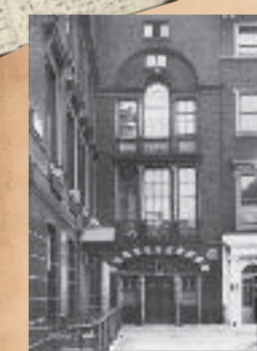
Exterior of Soho Square