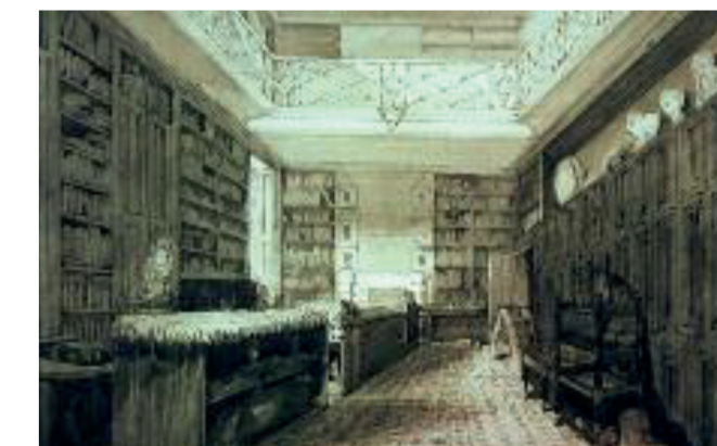
The library at Soho Square

choicest collection of drawings coloured by Parkinson, and 1,300 or 1,400 more drawn with each of them a flower, leaf and a portion of the stalk, coloured by the same hand."