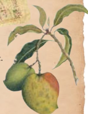
Parkinson's drawing of Mango © Natural History Museum, London

Kew remained a lifelong interest. It was not only a fascinating ornamental garden of exotic plants, it was an essential tool in understanding, preserving, growing and acclimatising as many different species of plants that could be found.