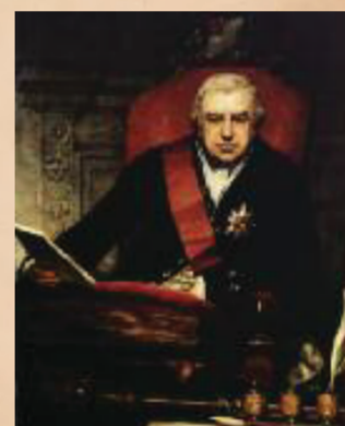
Portrait of Banks as President of the Royal Society by Thomas Phillips 1815

Banks was elected President in 1778, a position he held until his death 42 years later. He received many honours including a Baronetcy in 1781, Order of the Bath in 1795 and Privy Councillor in 1797, together with countless honorary memberships to learned societies in England and abroad. Banks thus was in a position to influence and support experimental work in all the sciences, and many young scientists received his patronage.